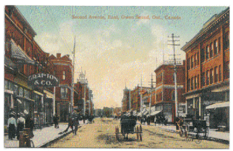
Above: An early postcard showing 2nd Ave. E. in Owen Sound Below: The card's reverse with a special cancel