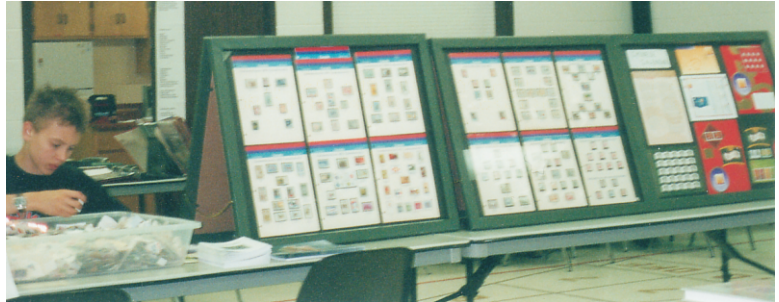
The "Young Persons" area at the Show

So, all in all, yes – another pretty good show!